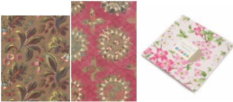
jelly rolls & charms