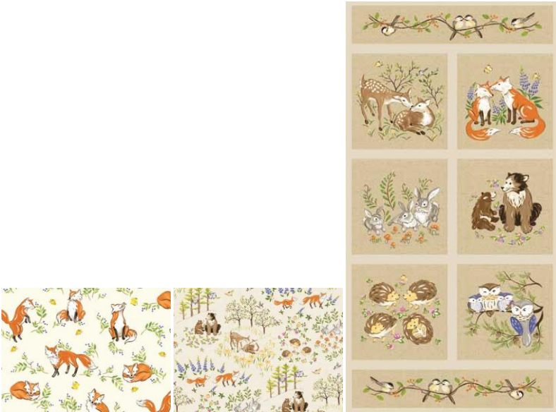
From Free Spirit: