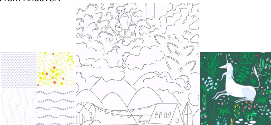
From Red Rooster: