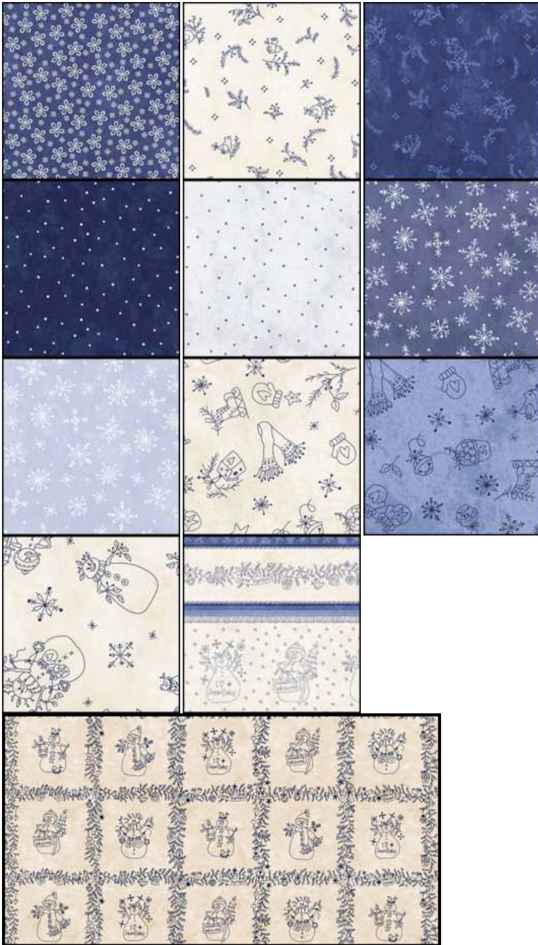
From Exclusively Quilters: