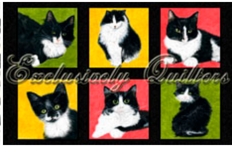
From Estudio: Back in stock