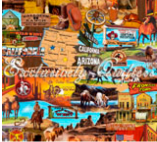
From Moda: Field guide