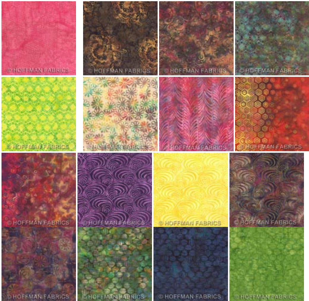
From Classic Cotton: