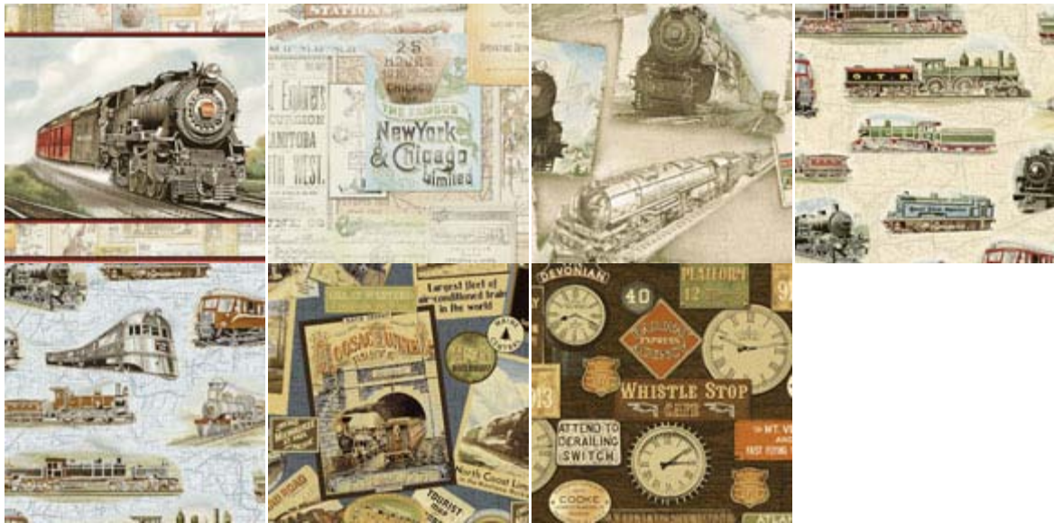
From Windham, the Freedom collection: