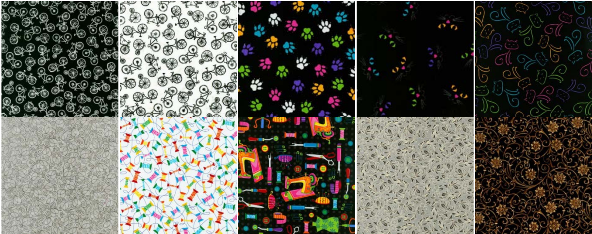
From Moda: Mirabelle